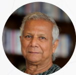
Prof. Muhammad Yunus Nobel Peace Laureate Founder & Former Managing Director, Grameen Bank